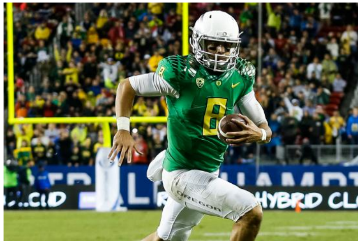
Oregon quarterback MARCUS MARIOTA accounted for five TDs (2 passing, 3 rushing) and threw for 303 yards as the Ducks racked up 617 yards of offense in a 38-point rout.